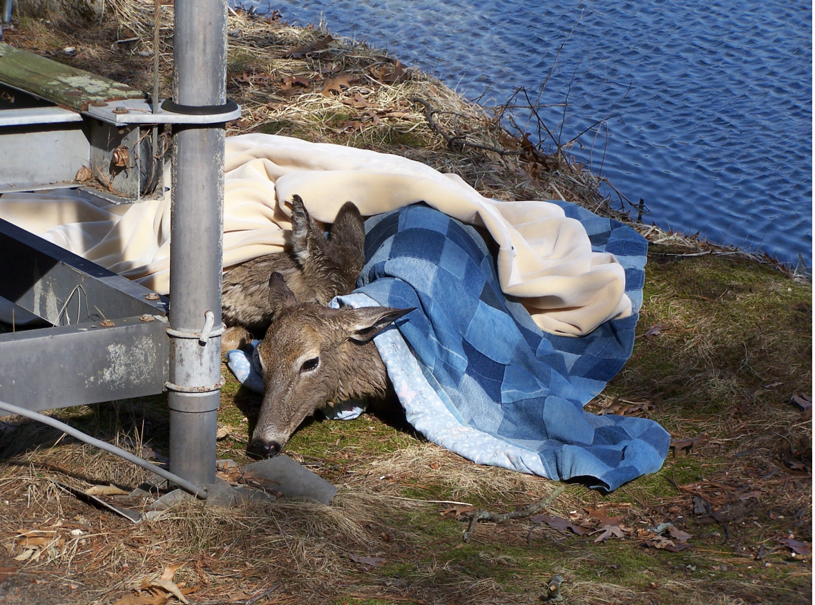
The men towed the mother to the west side of the lake (the current Alkema property) where onlookers were waiting with blankets. It took the exhausted two a full three hours to recover before wandering off.